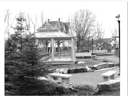
Take time for a rest or a picnic at the new Heritage Park next to building #22